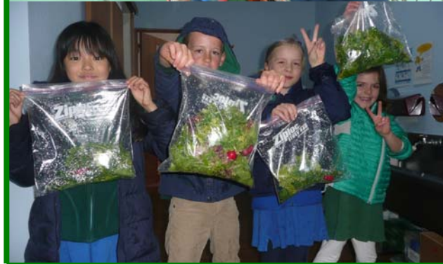
Picking and showing off their harvest.