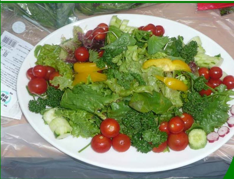
Lunch! TIS-grown lettuce, parsley, baby leaves and more. Students also enjoyed mint tea, freshly made using their own plant.